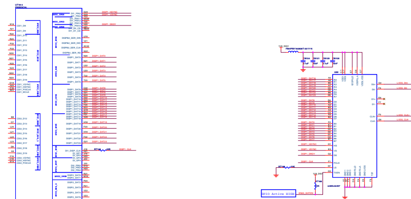
LVDS transmitter board

A FPC connector transmitter board to reciever board