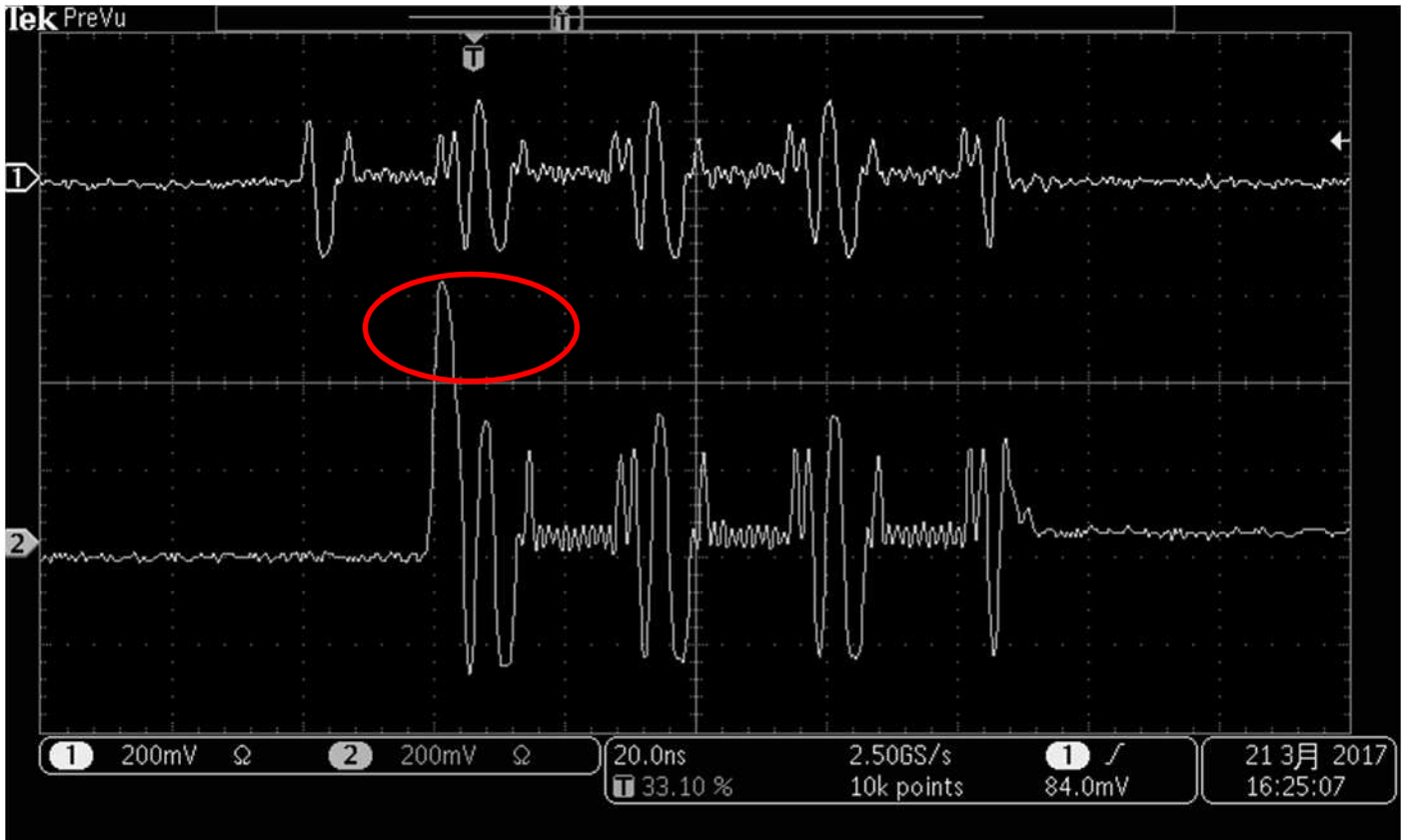
Upper Waveform : 1st COMWAKE of CPU output Lower Waveform : 1st COMWAKE of repeater output