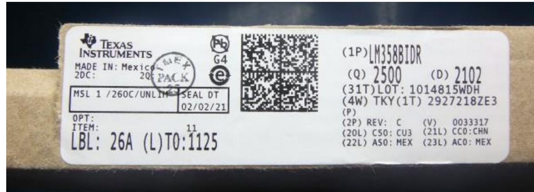
MSL 1 rating – DC 21+