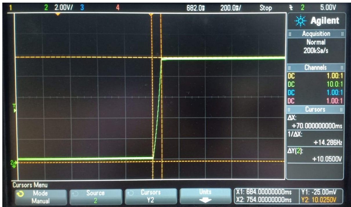
Figure 3 : LDO Ouput