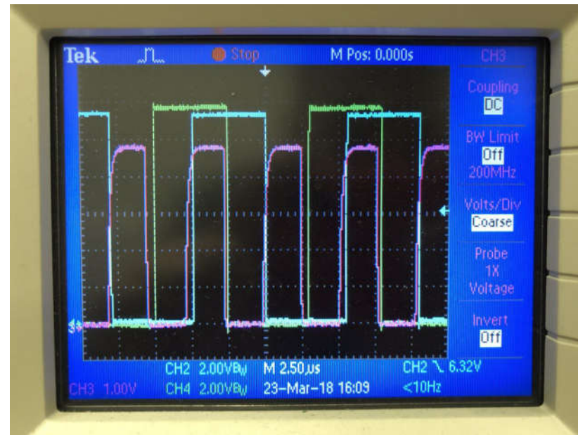
Figure 1 – PWMmaster (blue) PWAMAslave (green) and SYNC (purple) when control card is inserted into power plate and supplied from lab source at multiple supply turn on and turn off. After supply reset shift takes one of three values: 0, 90 (the rarest case), 180 degrees