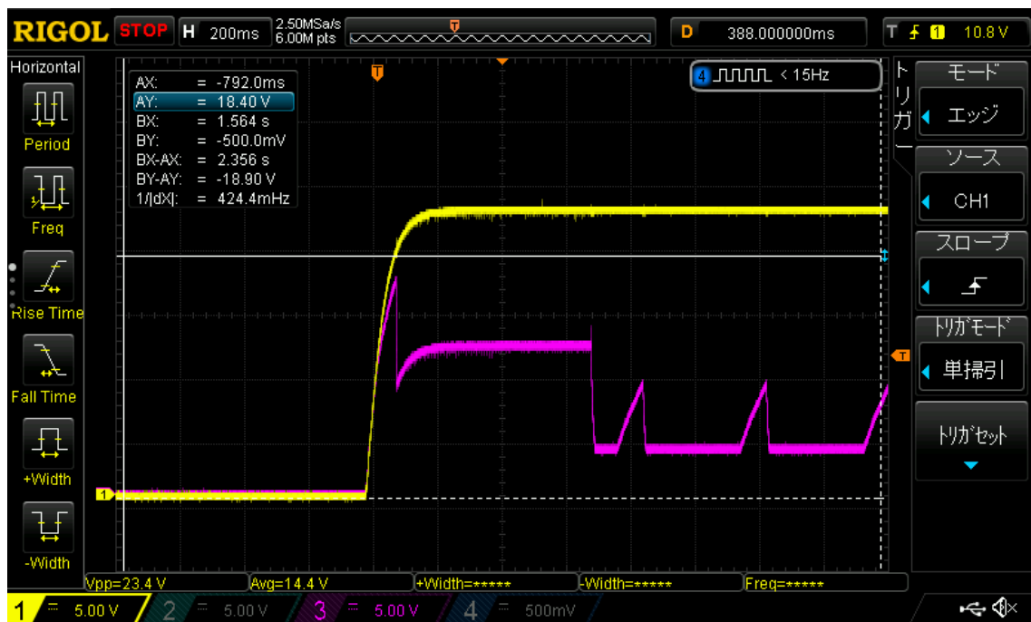
Fig.8a Full-bridge without eFuse (Yellow : VIN=22V、Pink : V-GND=3.3V~11.3V)

※ If you jumper eFuse, it will work normally. The potential of GND moves based on VIN.