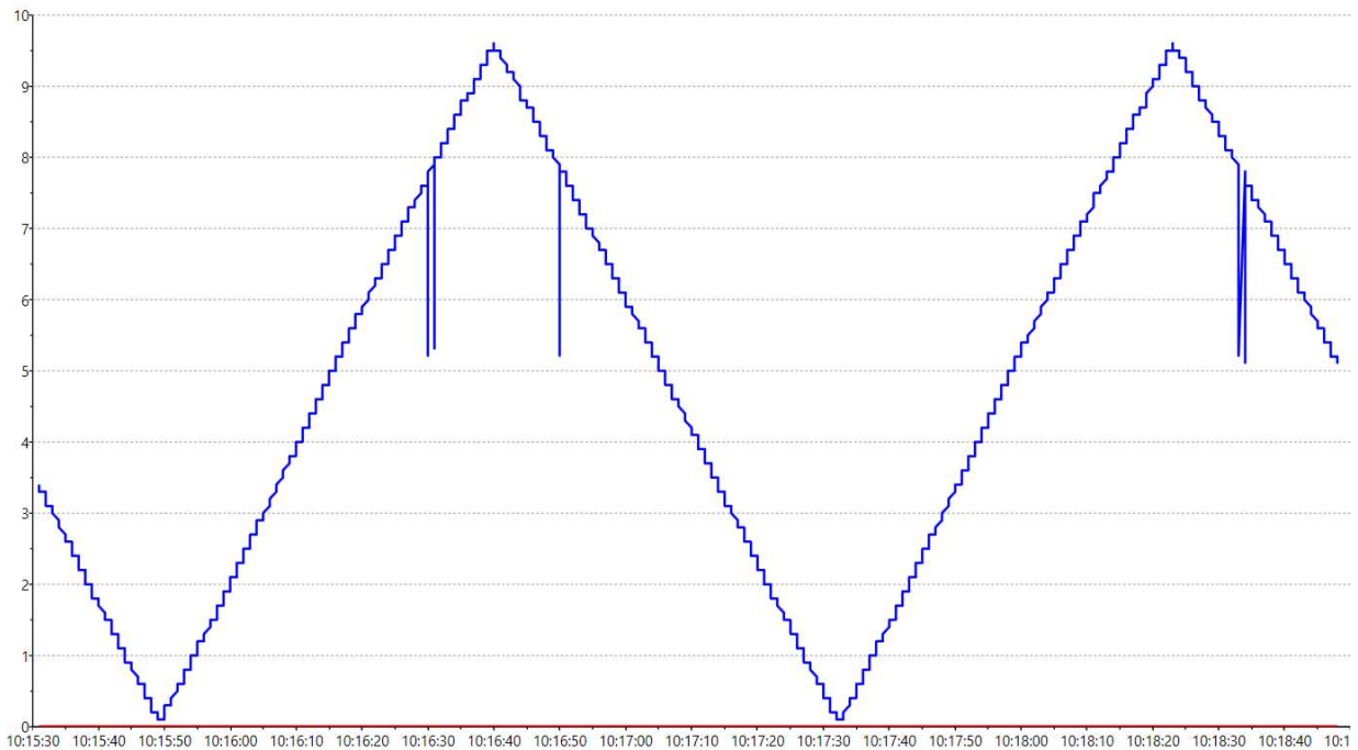
Sweep 0-10V on ADC2, ADC1 floating (Is the LSB from ADC1 doing this?)