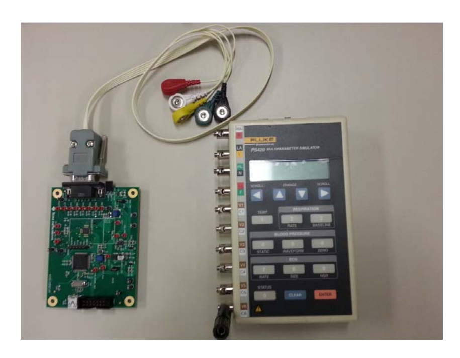
Figure 1. the proper ECG cable.