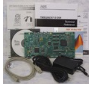
DSP Starter Kit (DSK) for the TMS320C6713 $449.00 Add To Cart