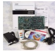
TMS320C6416 (1 Ghz) DSP Starter Kit (DSK)

All prices are in USD. Copyright 2020 Spectrum Digital Incorporated. Sitemap | Shopping Cart Software by BigCommerce